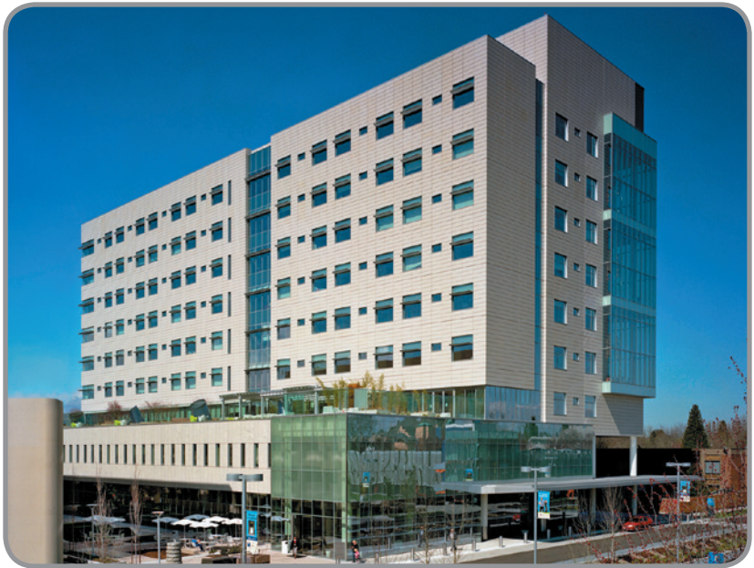
Randall Children's Hospital

Participants will gain practical knowledge from the multidisciplinary faculty via lectures, case presentations and literature reviews on current information for a variety of conditions affecting children and adolescents.