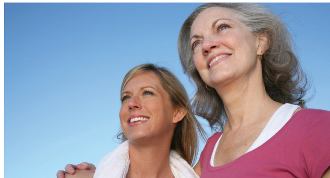
You should have an annual mammogram if you are over 40 or have a family history of breast cancer.

Between the ages of 20 and 39, every woman should have a clinical breast exam every three years; and after age 40 every woman should have a clinical breast exam done each year. Every woman should do a self-exam once