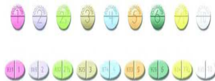
Warfarin (Coumadin®) comes in various colors and tablet shapes