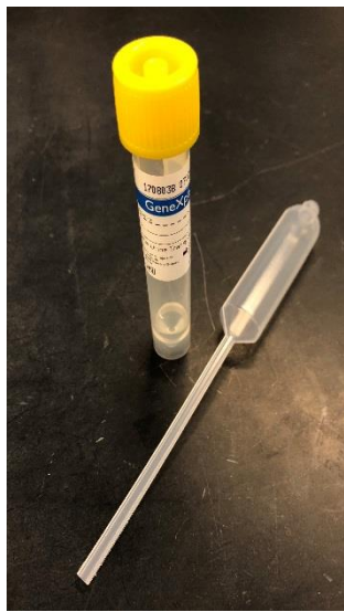
Figure A - Supply# 372283

LLS now offers Trichomonas Vaginalis testing for both male and female specimens.