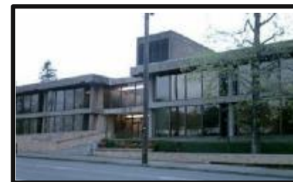
Legacy Clinic Emanuel