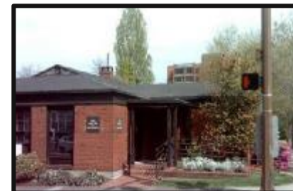
Legacy Clinic Good Samaritan