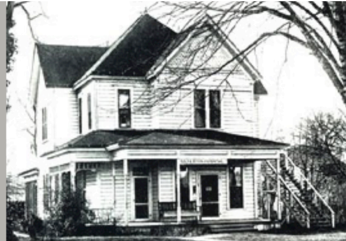
Silverton Hospital, circa 1918

In 1918, Silverton Hospital opened in a rambling old house. It was funded by the community at $5 a share.